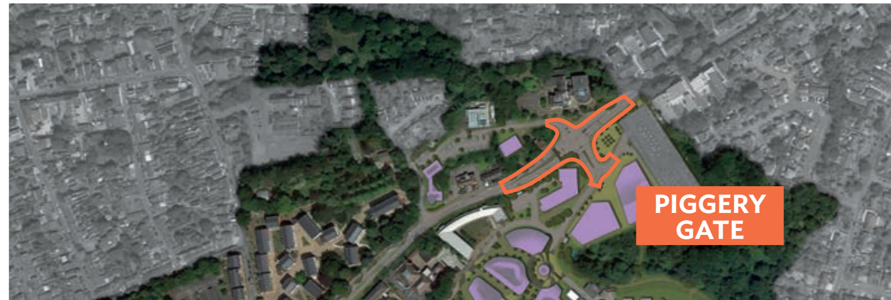
Approved layout drawing from 2015

In time, the Piggery Gate junction will be used to access the multi-storey car park proposed in the 2015 Estate Plan at the edge of the campus. The new car park will be progressed, as required, following the completion of the buildings proposed in this location.