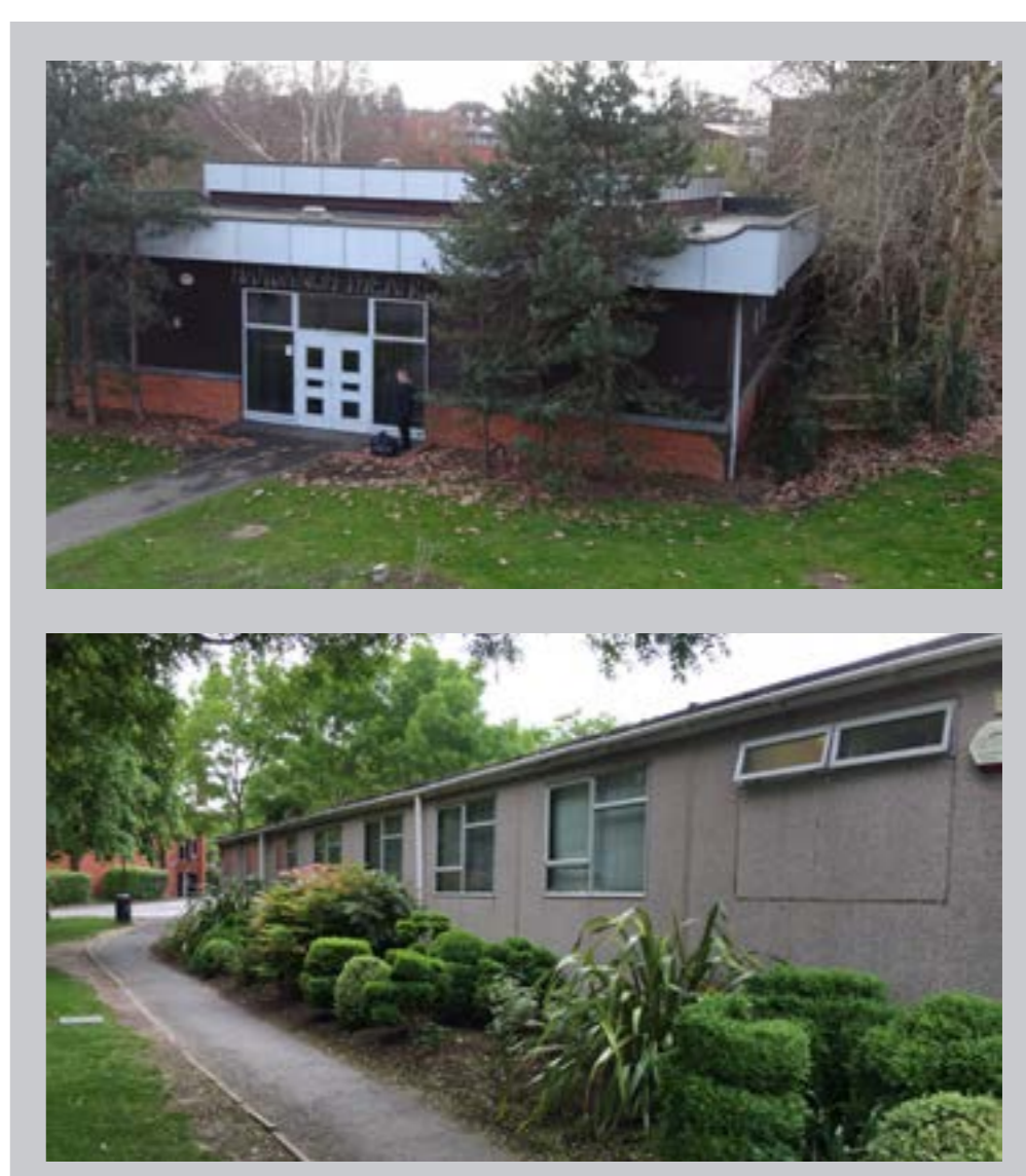
Existing Buildings (Handa Noh Theatre & Orchard Building)