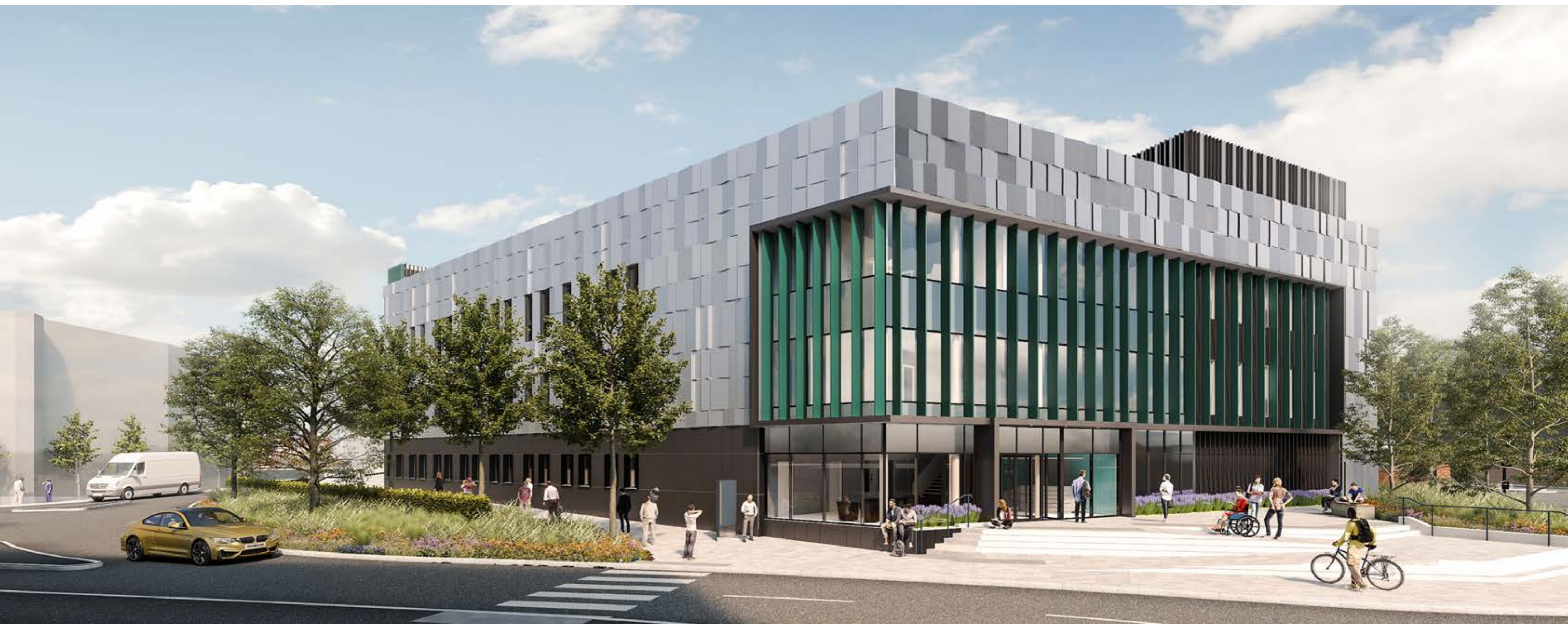
Artist's Impression of Building Entrance