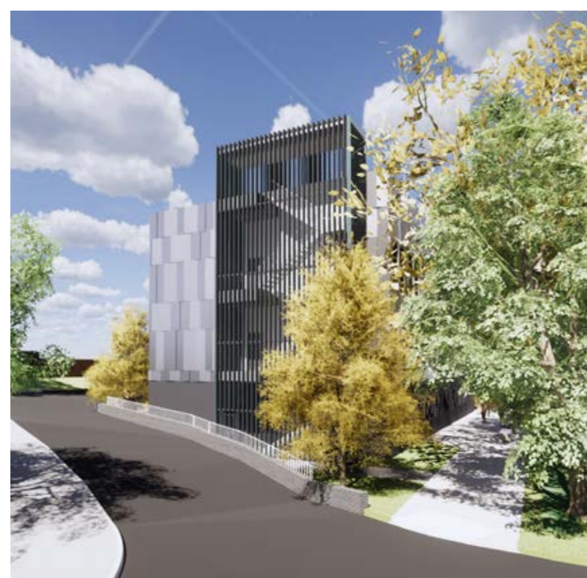
Artist's Impression of approach from internal spine road