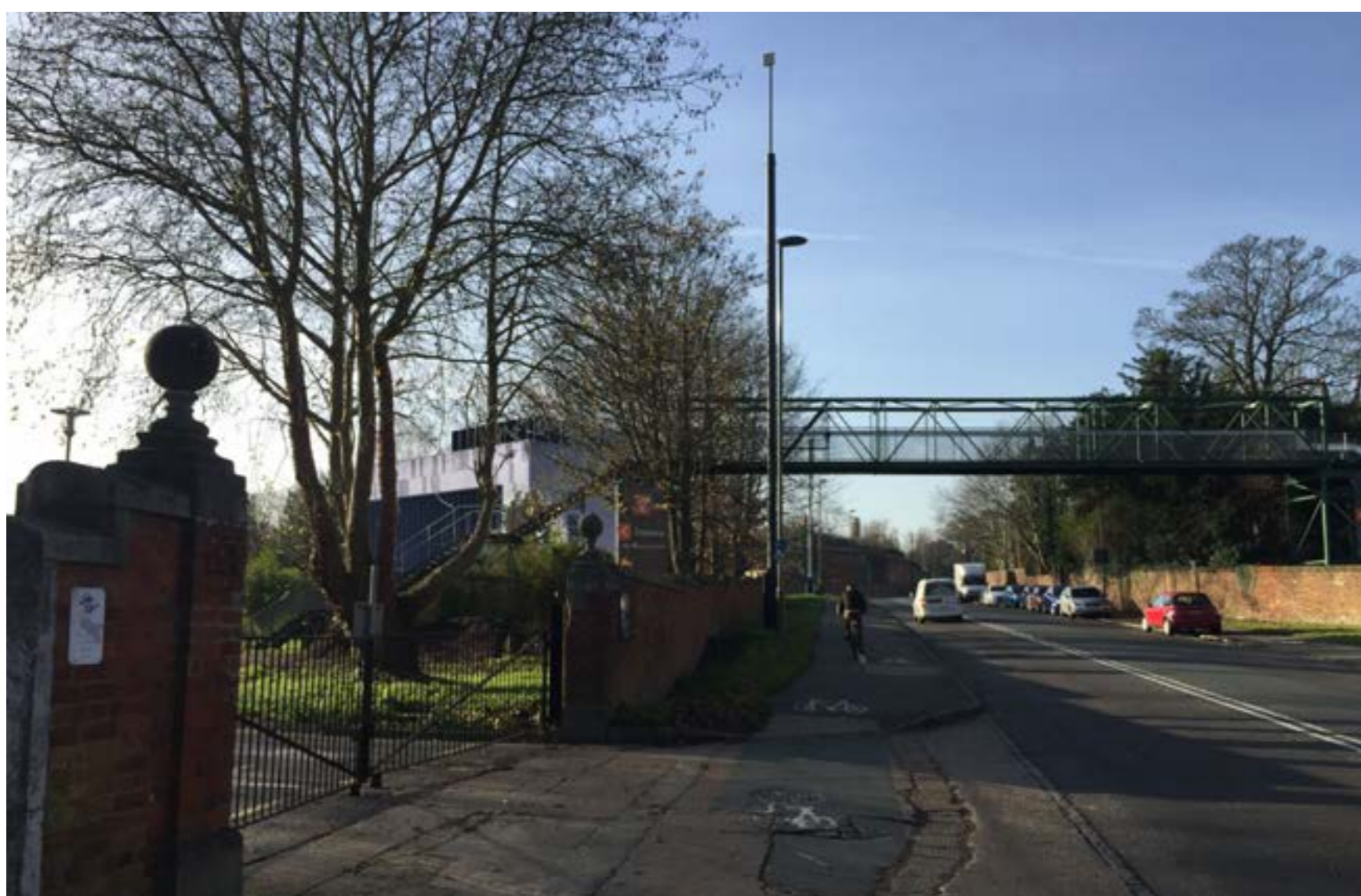
Artist's Impression of Existing view from A30